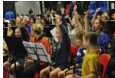
SIM Primary Band Workshop

flute, clarinet, brass or percussion in the instrumental program at their primary school were given the opportunity to come to Melville SHS in order to participate in a large ensemble. Experienced SIM teachers who work in the local area and are specialists in their instruments ran the workshops and parents were treated to a performance at the end of the day.